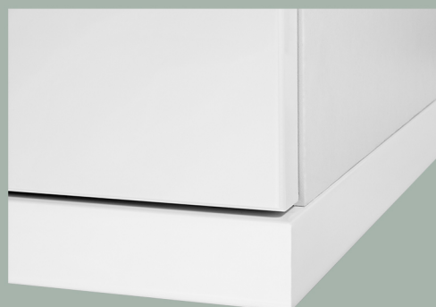
Matching Straight Cornice / Pelmet