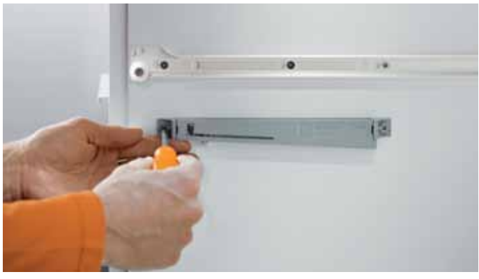
BLUMOTION for METABOX attaches on the left side of the cabinet, below the cabinet profile.