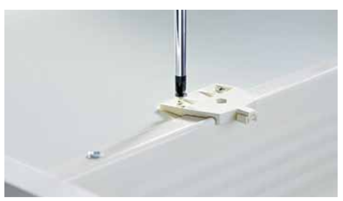
Two screws in the bottom and one in the drawer profile are required. All three are required for proper function