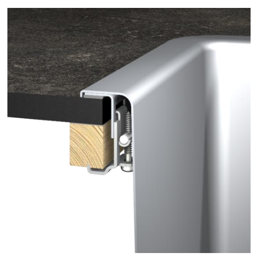
Fig. 2 – Compact laminate worktop